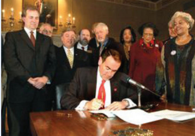
Gov. Huckabee signs minimum wage legislation.

No one who works full time should live in poverty, and AACF worked with the Give Arkansas a Raise Now Coalition to help lead to the passage of landmark legislation raising the state minimum wage from $5.15 to $6.25 an hour, a major victory for low-income families. This will provide low-income families more money to help meet basic needs. The legislation was adopted during a specially called legislative session on education reform. Arkansas became the first state among our southern neighbors to adopt a state minimum wage higher than the federal standard. Our research on economic self-sufficiency was used to make the case for raising the minimum wage.