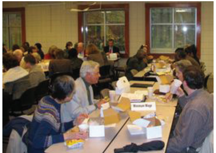
Roundtable discussion at the Kids Count Pre-Legislative Conference

The Arkansas Kids Count Coalition, staffed by AACF, continued to be a strong voice for children. In preparation for the 2007 legislative session the coalition produced a candidate's guide defining key children's issues and solutions that could be used when interacting with candidates during their campaigns and after the election. AACF and our Kids Count Coalition partners also continued our efforts to help educate the public and future public officials about the importance of public policies impacting children by holding two advocacy training academies, two regional conferences, and a candidates' forum. The final capstone activity for the year was the Pre-legislative Conference. The newly elected Governor Mike Beebe spoke at the conference.