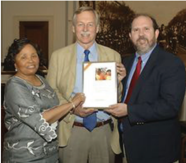
Congressman Vic Snyder (D-AR) presents the National Pre-K Champion award to AACF staff in Washington, DC.

numerous meetings and conferences, local events held by partners, legislative briefings, and the publication of op-eds and letters to the editor. Together, our work has helped build support among the media, general public, and policy-makers to make pre-k available to all families.