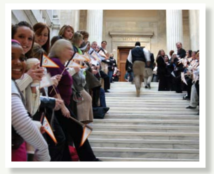
Arkansas Kids Count Coalition members line the steps of the Arkansas House of Representatives before a critical vote to raise the tobacco tax.

• Initiating coordinated school health programs, which use schools as vehicles to improve child health by coordinating health care access, extending community partnerships and promoting healthy behavior among students and families.