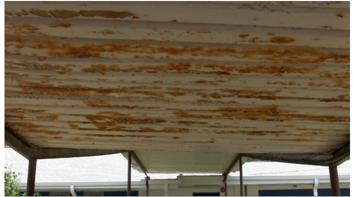
Differences in school facilities can come down to the simplest things, like awnings.

million in commitments. The following chart makes it easy to see that annually Arkansas far outspends the amount of revenue invested each year since the one-time windfall of $501.1 million invested in FY2008. Now that this amount is almost depleted, the current level of funding annually can't be maintained, and Arkansas will be unable to continue to meet its public school facility needs, without additional state funding.