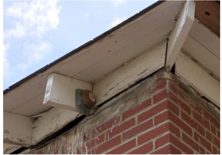
New construction at one Arkansas high school. Rotted wood tops one building at another.

mentation and the Commission's determination was based on discussions with members of the Task Force and legislators who stated that the intent of the program was for construction of new facilities after the districts' immediate repair needs were addressed by the Immediate Repair and the Transitional Programs. Renovations and repairs could be addressed by the 9 percent of foundation funding. The actual trend of the program was for more districts to apply for warm, safe, and dry systems, particularly HVAC systems, as districts sought to gain efficiencies in their energy requirements. With a continuing trend for more warm, safe, and dry system projects, funding may not have been available for growth/suitability projects or for replacement of facilities.