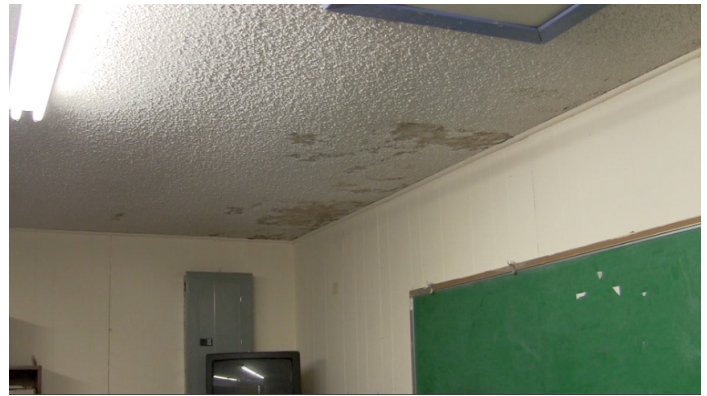
Some high schools in Arkansas can afford high-tech health teaching tools while others can barely prevent leaky ceilings.

are supposed to use that portion of foundation funding provided for school operation and maintenance to finance systems and roof repairs. An unintended consequence is that some districts may decide to stop maintenance of those systems and structures so they qualify sooner for a system replacement through the program according to program administrators.