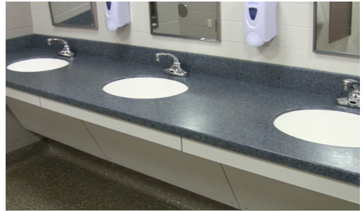
Old restroom facilities at a high school in southeast Arkansas pale in comparison to newer, automated facilities at other schools.

Originally there were four programs but two of those were designed to meet temporary needs while transitioning from the old system of facility funding to the new system. Those two programs have expired. The two remaining programs are the Catastrophic and the Partnership Programs. The Catastrophic program is for unusual losses of school facilities such as those resulting from fire or tornadoes. In practice, school districts' insurance is sufficient for most of those expenses.