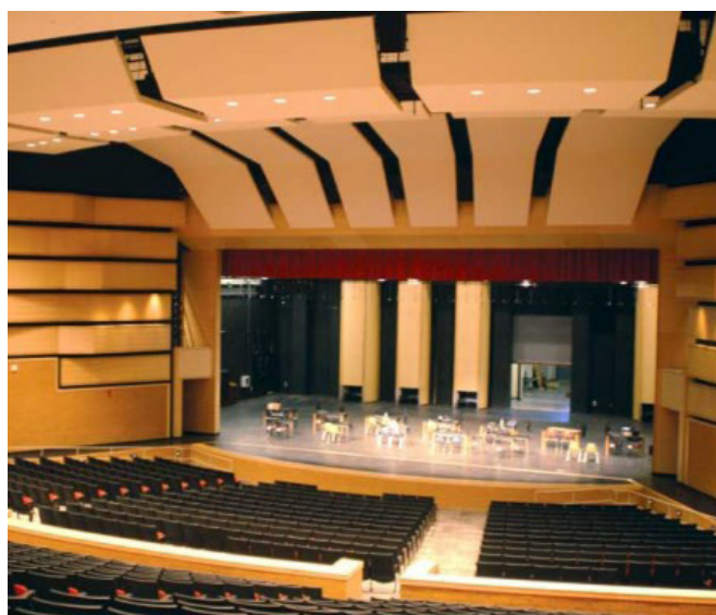
Auditorium at Maumelle Highschool, from www.arktimes.com

The state of Arkansas, for example, has defined adequate facilities as those meeting a minimal standard of warm, safe, and dry. But in some wealthier zip codes in the state, students have access to state-of-the-art facilities that promote hands on, experiential based learning, e.g., television broadcast facilities, performing arts centers, and health careers rooms with computerized, college-quality equipment.