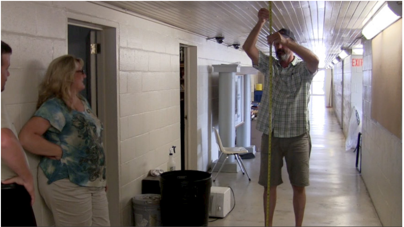
Low ceilings and cramped spaces are the norm at this Arkansas high school.