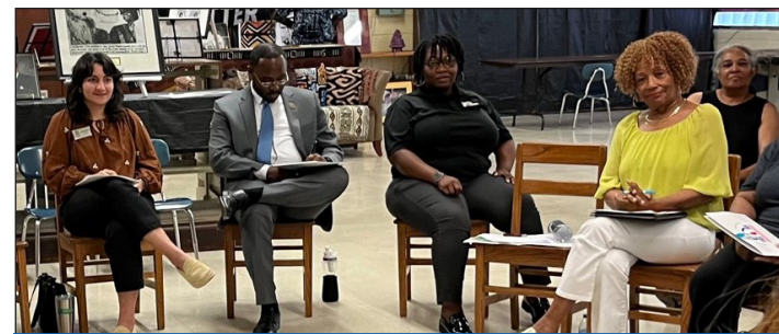
Helena-West Helena Children's Policy Summit